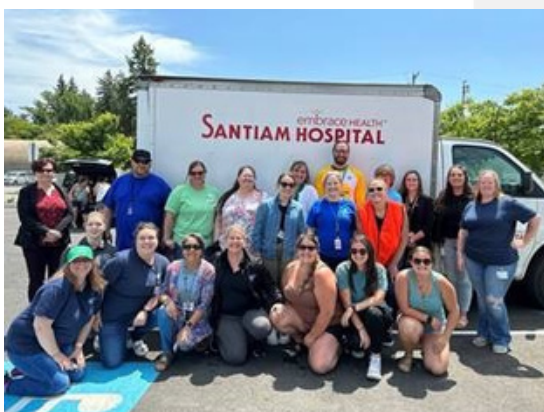
6/15/23 - "Seasons of Safety" brought community organizations together to provide support and resources to families in Mill City as they headed into summer.

Is there an organization or upcoming event SafeOregon should be connecting with? Let us know at safeoregon@osp.oregon.gov .