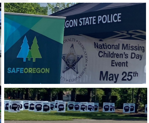
5/25/2023 - The annual missing children's day event at the Salem Capital Mall.